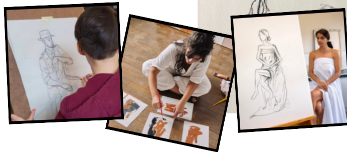
FIGURE ILLUSTRATION (PART 2) INCLUDES EXPERIENTIAL LEARNING COMPONENT