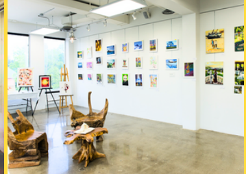
FIGURE ILLUSTRATION (PART 1) HANDS-ON WORKSHOP

This workshop aims to teach students the fundamentals of drawing the human form, including anatomy and basic gesture. Participants will explore the human figure in depth through exciting rapid-fire practice. Students will learn how to replicate accurate proportions by breaking down the body into various forms, and studying various dynamic vs. static poses.